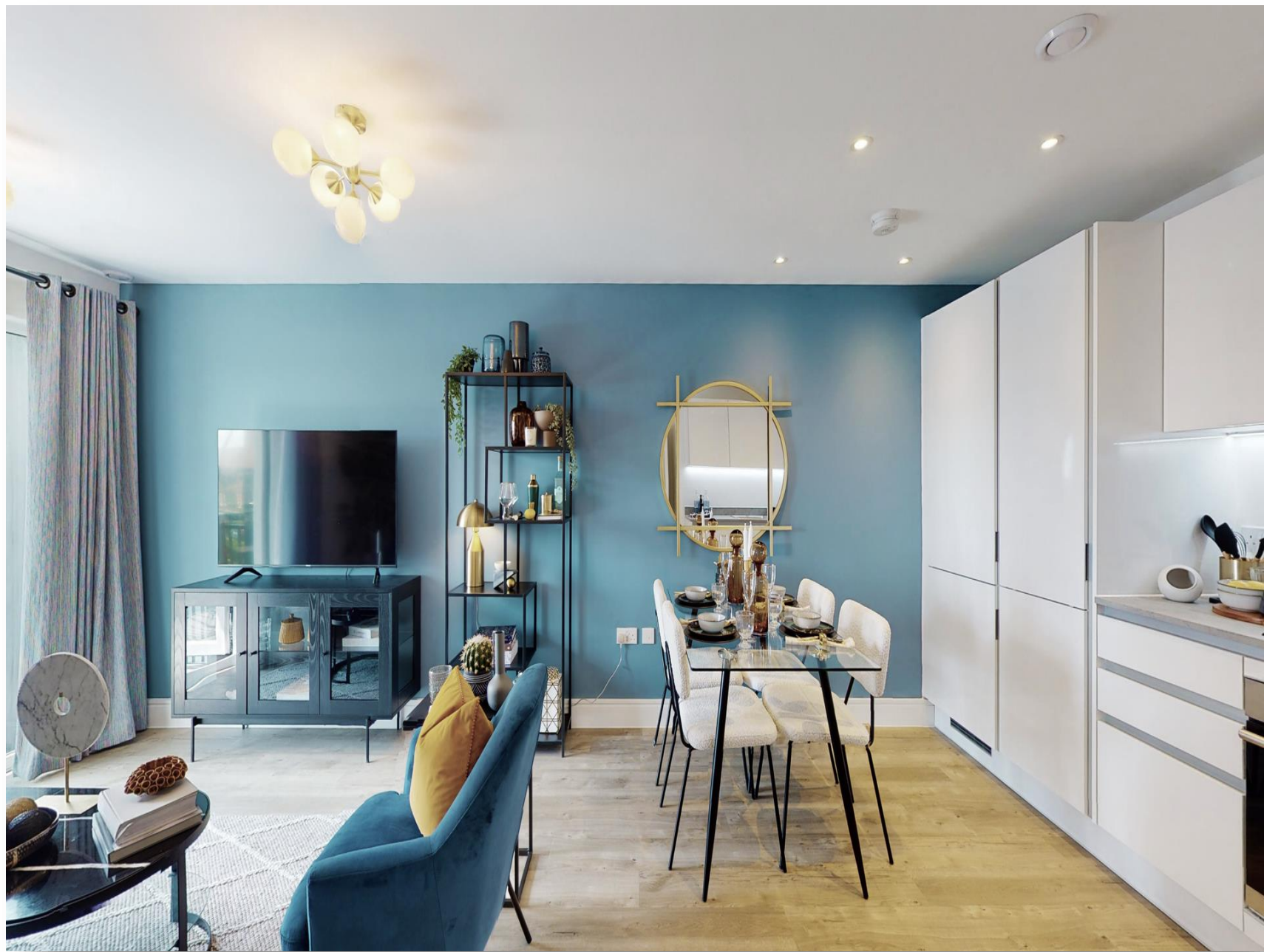
Television House, Meridian Way Southampton SO14 0FS