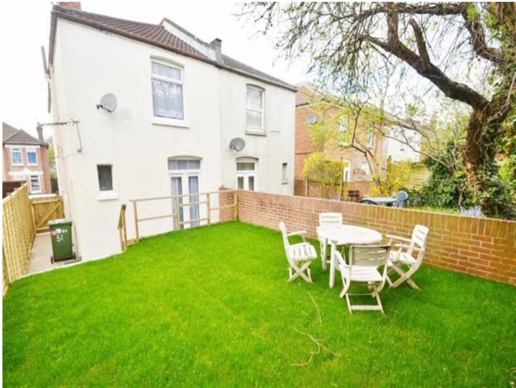
Newcombe Road, Southampton SO15 2FT