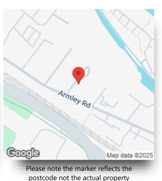
view this property online williamhbrown.co.uk/Property/PDY112984