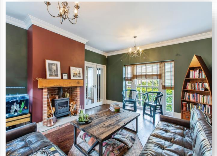
Lawns House Chapel Lane, New Farnley Leeds LS12 5DT