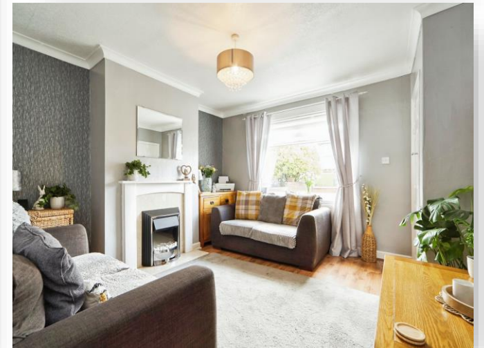
Swinnow Crescent, Stanningley Pudsey LS28 6NZ