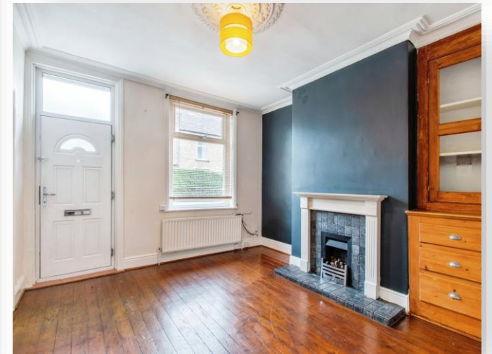
Gladstone Terrace, Stanningley Pudsey LS28 6NE