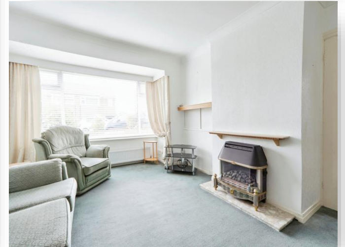
Spring Valley Avenue, Leeds LS13 4RR