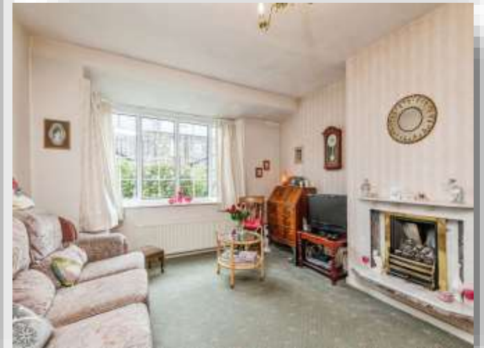
Occupation Lane, Pudsey LS28 8HL