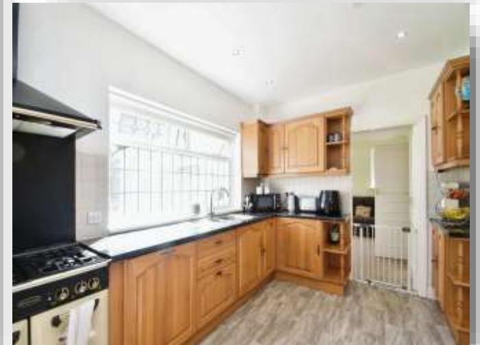
Woodhall Park Crescent East, Stanningley Pudsey LS28 7HG