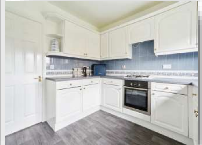
Holme Farm Court, Leeds LS12 5UA