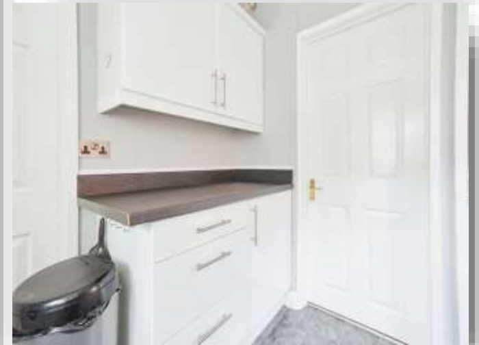
Langley Road, Bramley LEEDS LS13 1AX