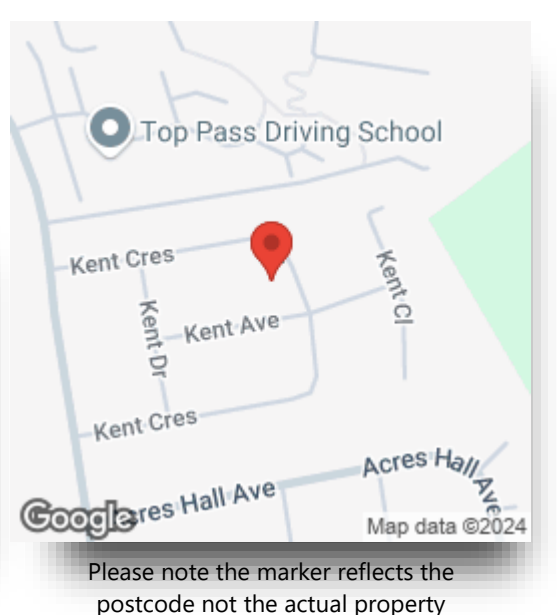
view this property online williamhbrown.co.uk/Property/PDY114443