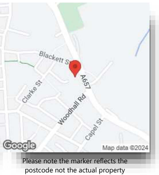
view this property online williamhbrown.co.uk/Property/PDY114339