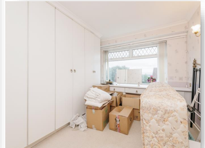
Green Hill Gardens, Farnley Leeds LS12 4HE