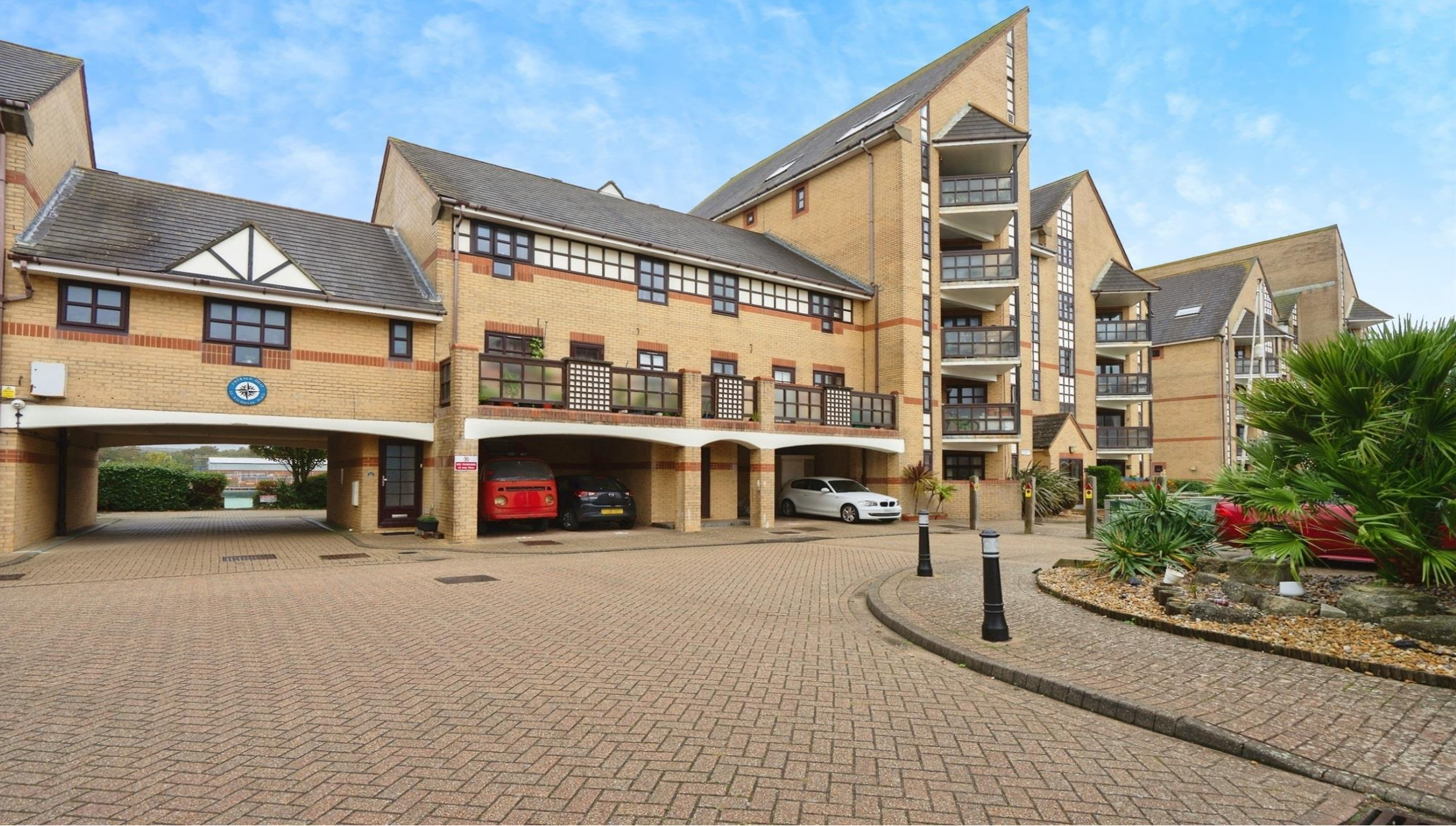
St. Nicholas Place Emerald Quay, Shoreham-By-Sea BN43 5JR