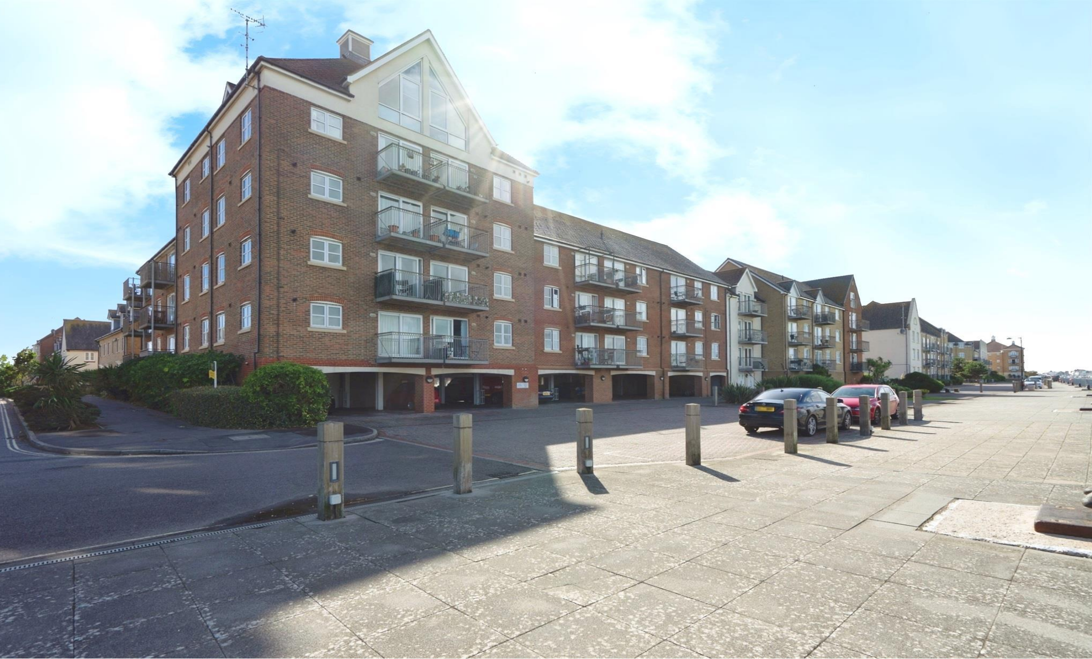
Sorlings Reach Sussex Wharf, SHOREHAM-BY-SEA BN43 5PD