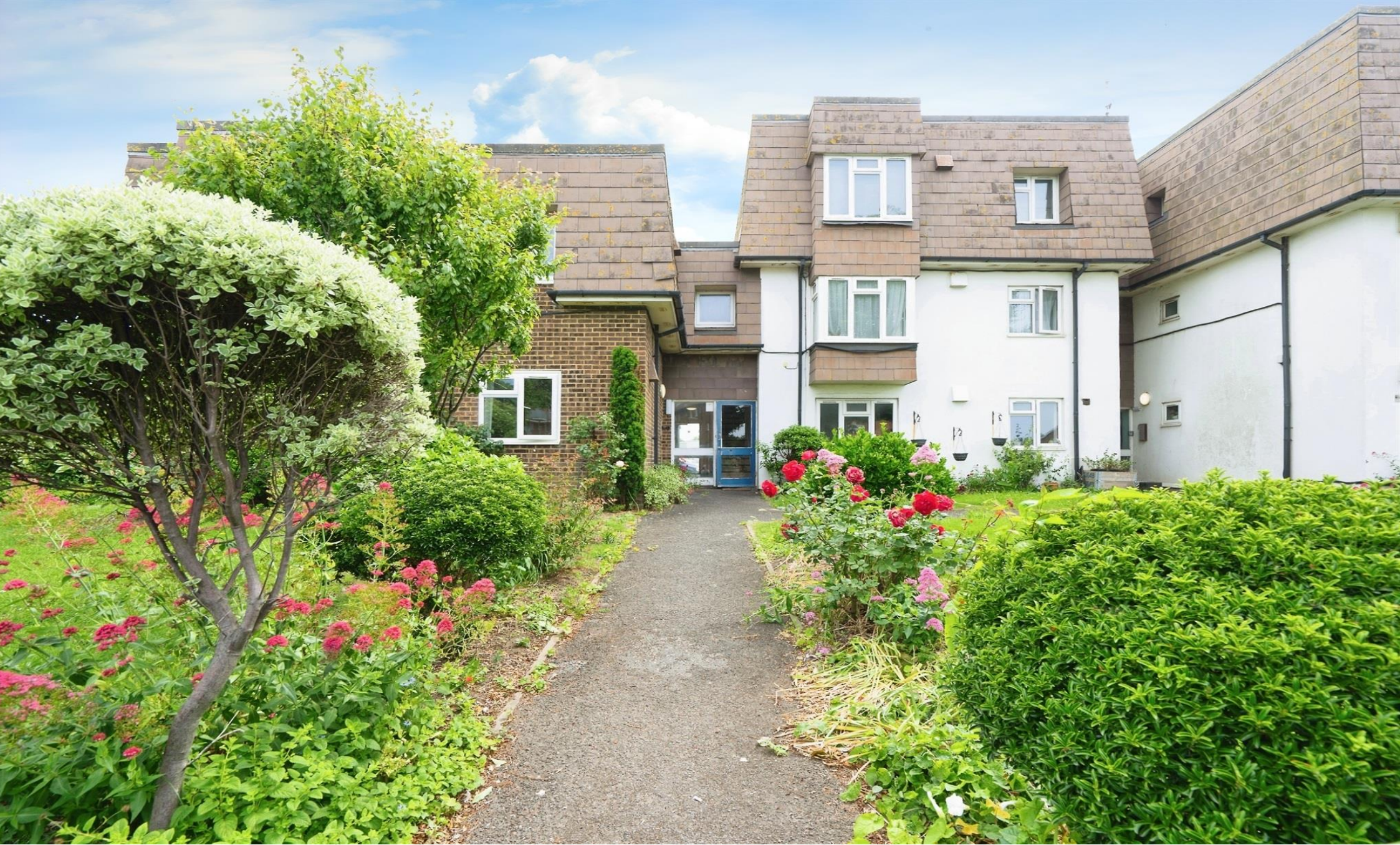
Spring Gardens, Southwick BRIGHTON BN42 4AF