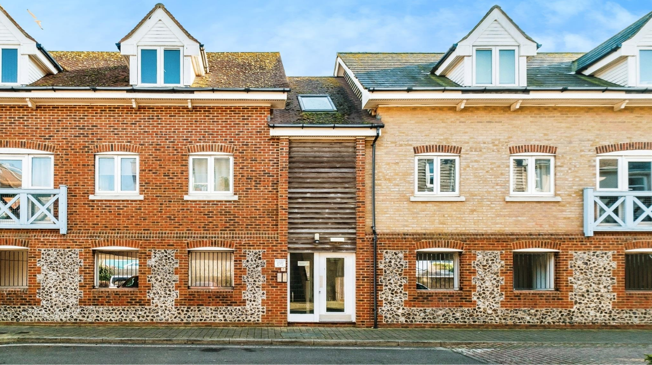
Weavers Court Ropetackle, Shoreham-By-Sea BN43 5ES