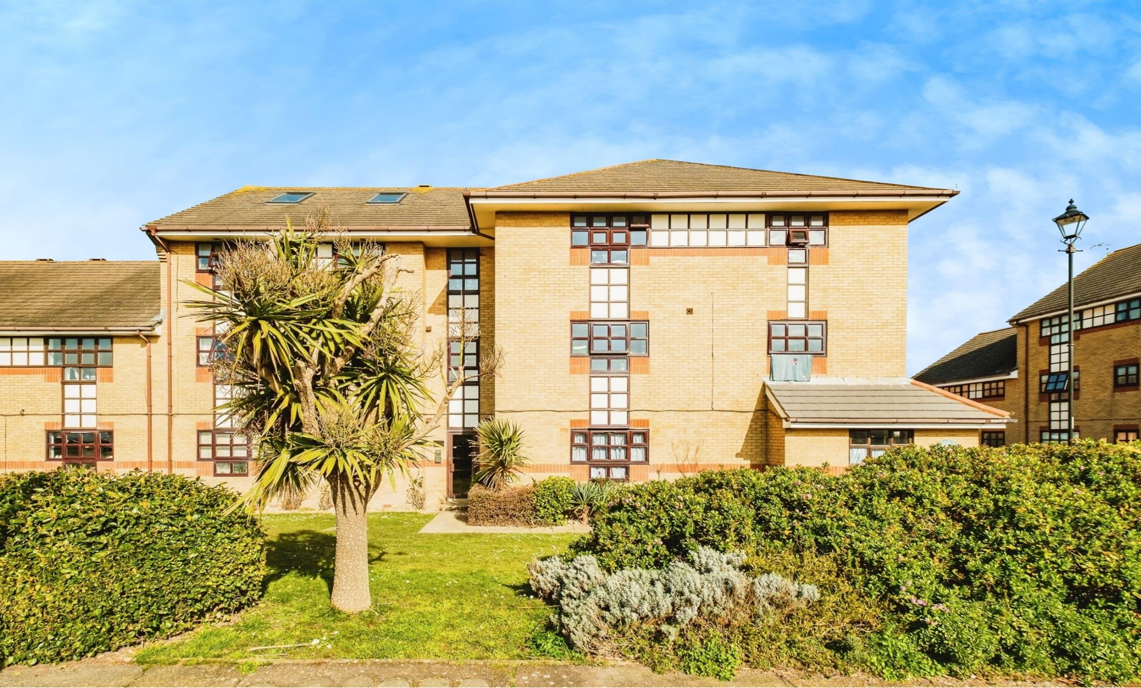
South Point Emerald Quay, Shoreham-By-Sea BN43 5JL