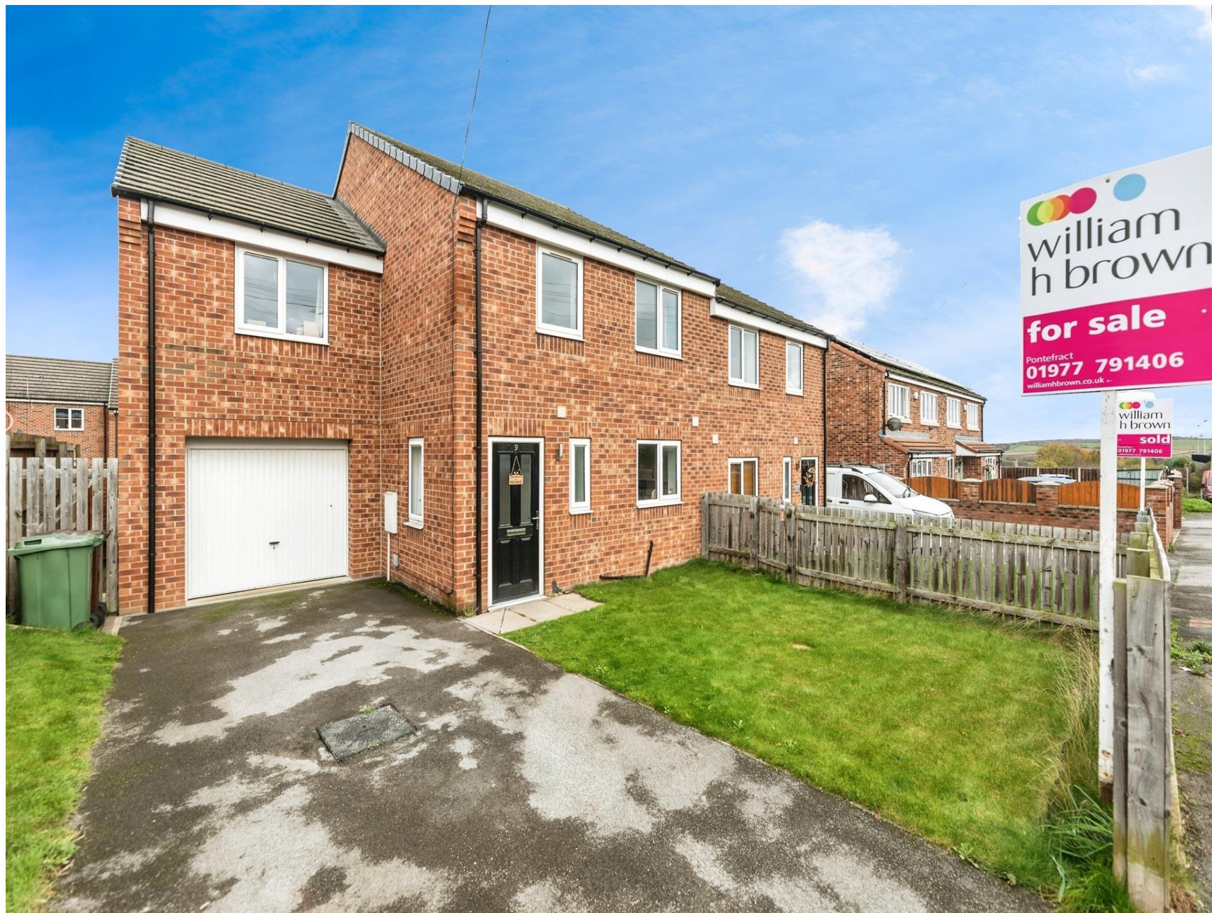
Albany Crescent, South Elmsall Pontefract WF9 2EL