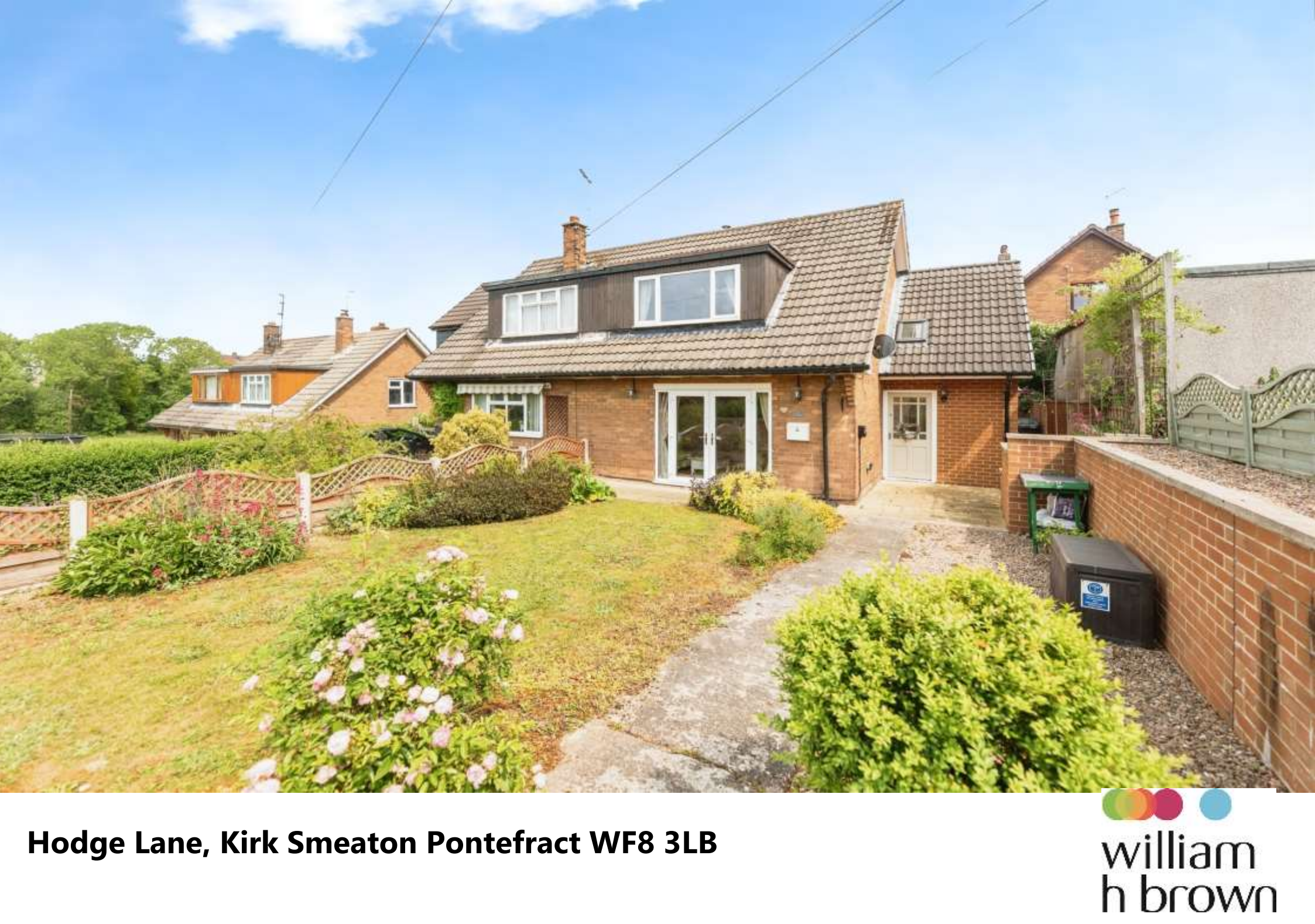
Hodge Lane, Kirk Smeaton Pontefract WF8 3LB