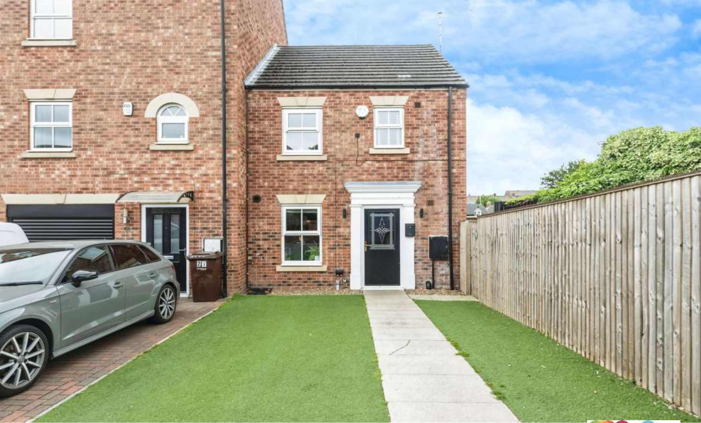
Marsden Mews, Hemsworth Pontefract WF9 4SY