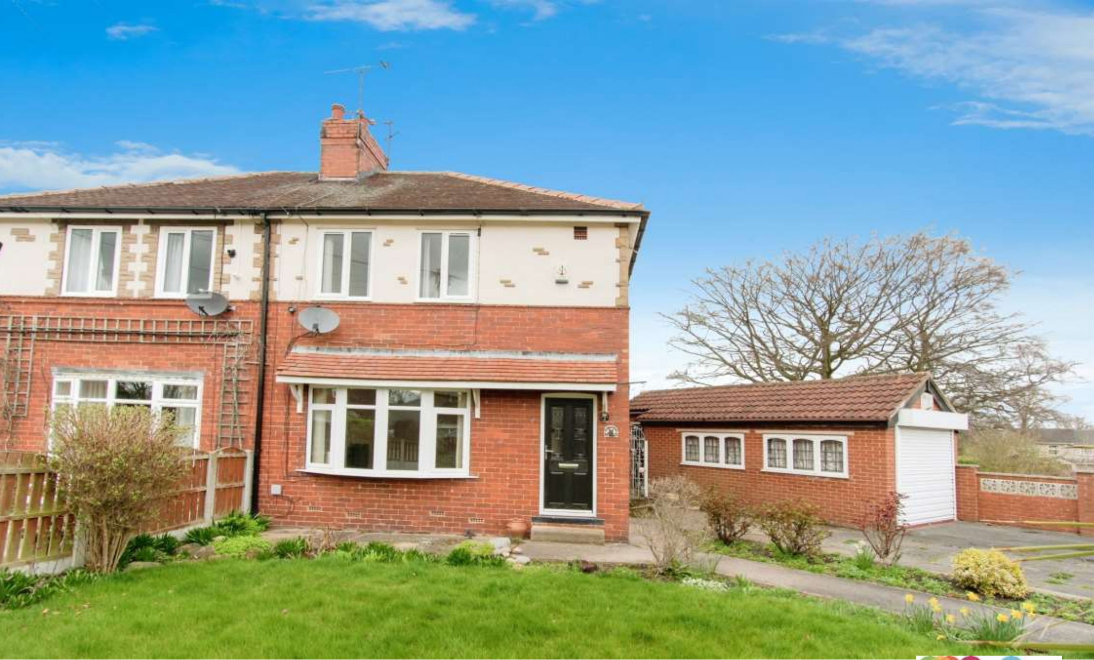
Chapel Garth, Ackworth Pontefract WF7 7NQ