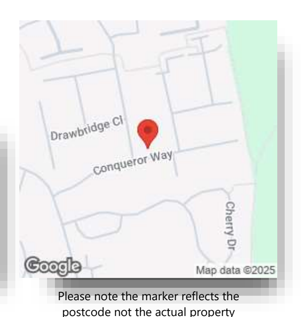
view this property online williamhbrown.co.uk/Property/PON118437