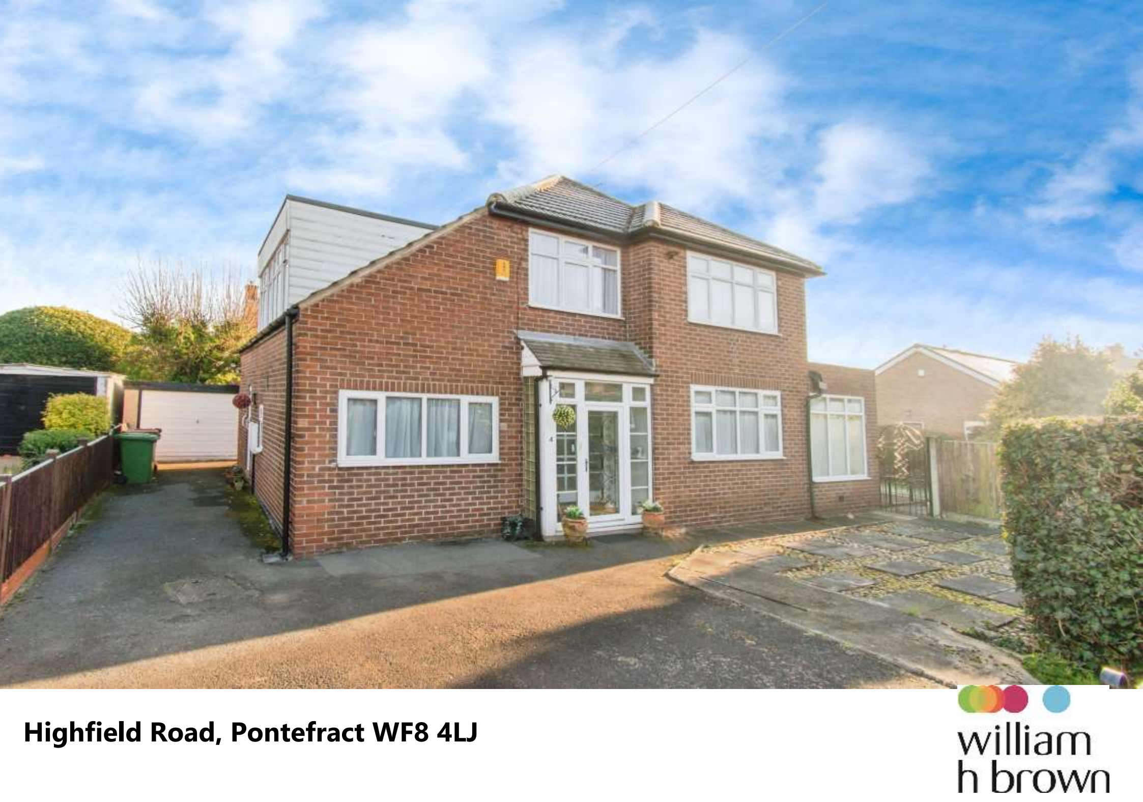
Highfield Road, Pontefract WF8 4LJ