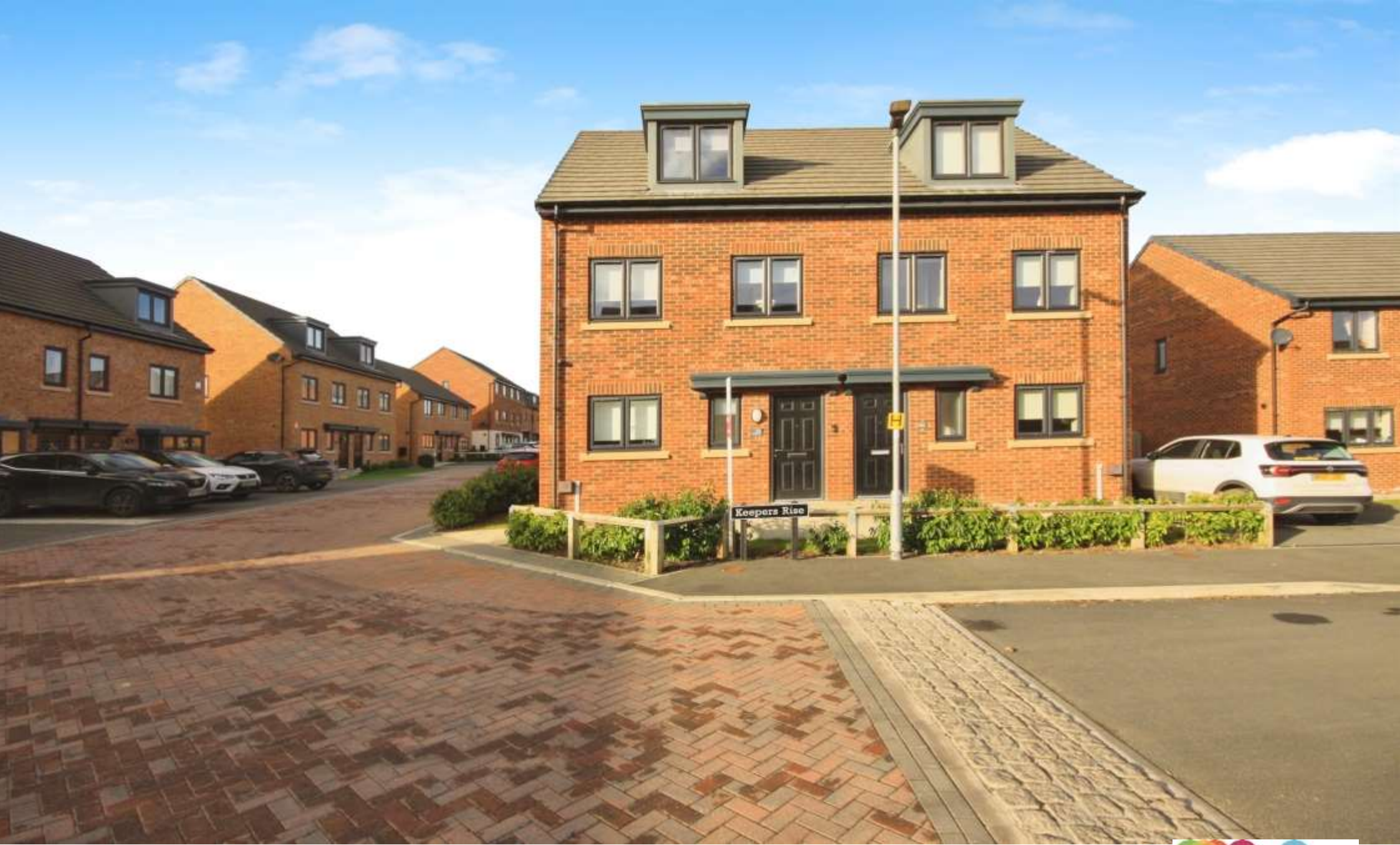
Keepers Rise, Hemsworth Pontefract WF9 4FL