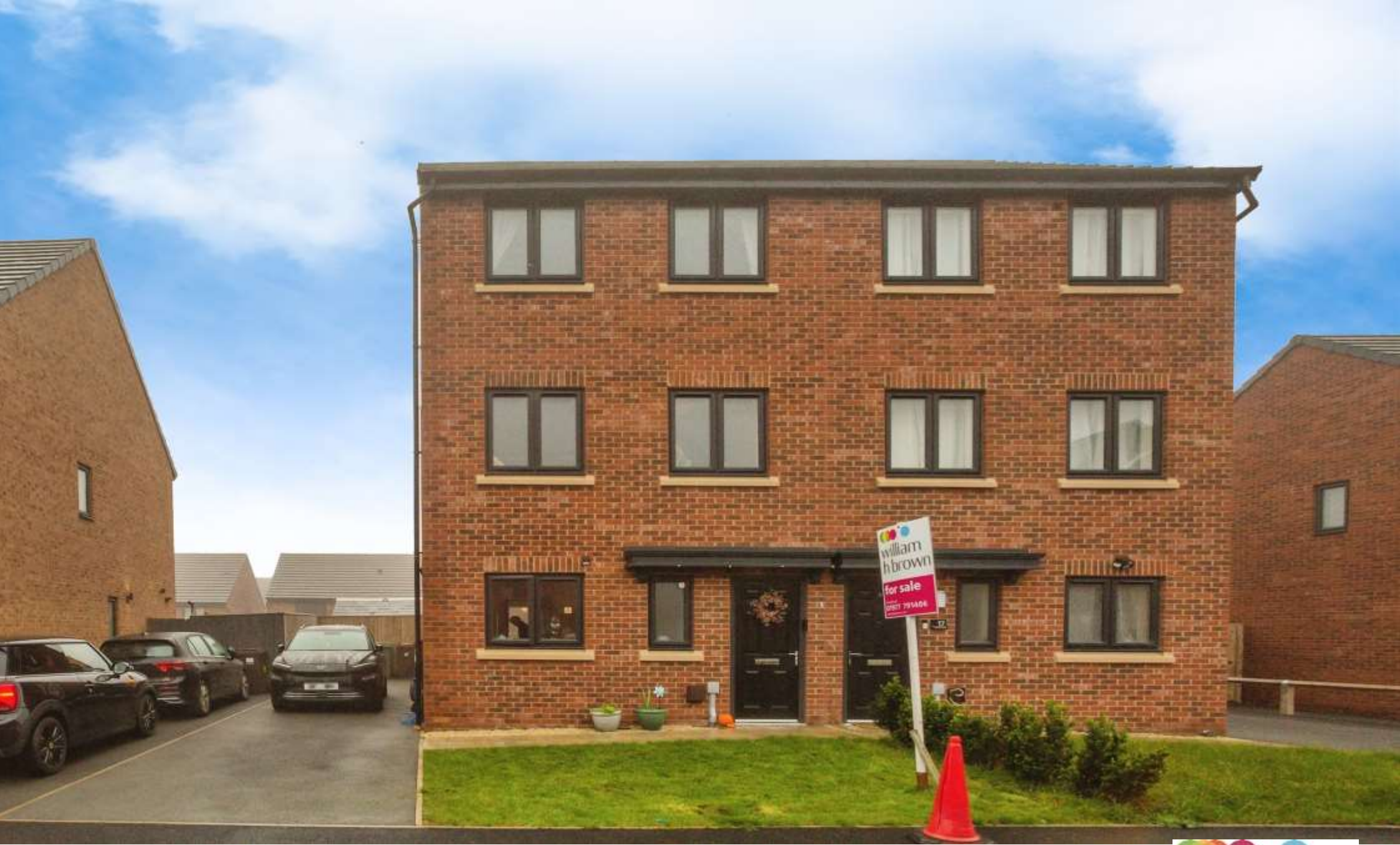
Miners Lane, Hemsworth Pontefract WF9 4FQ