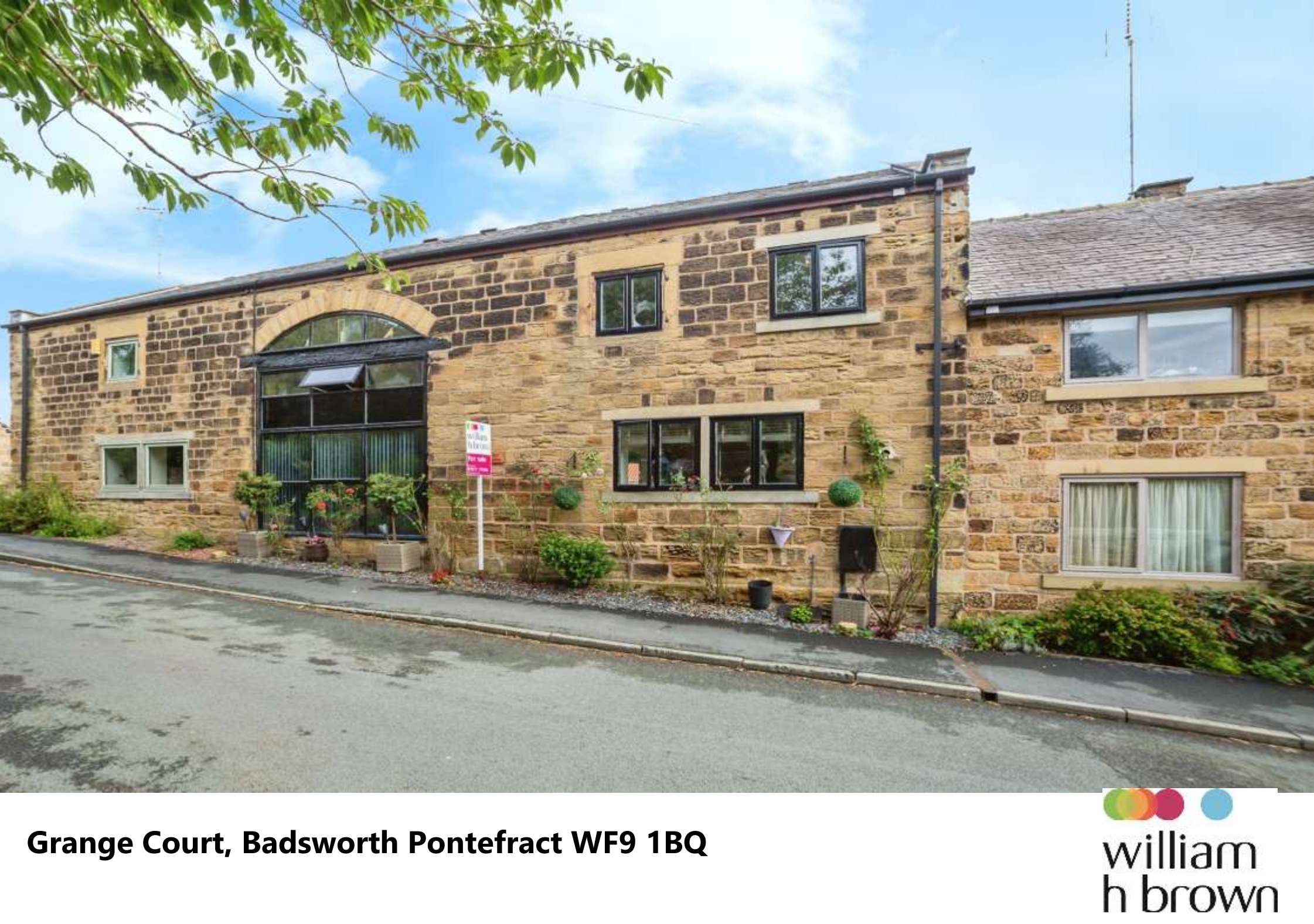
Grange Court, Badsworth Pontefract WF9 1BQ