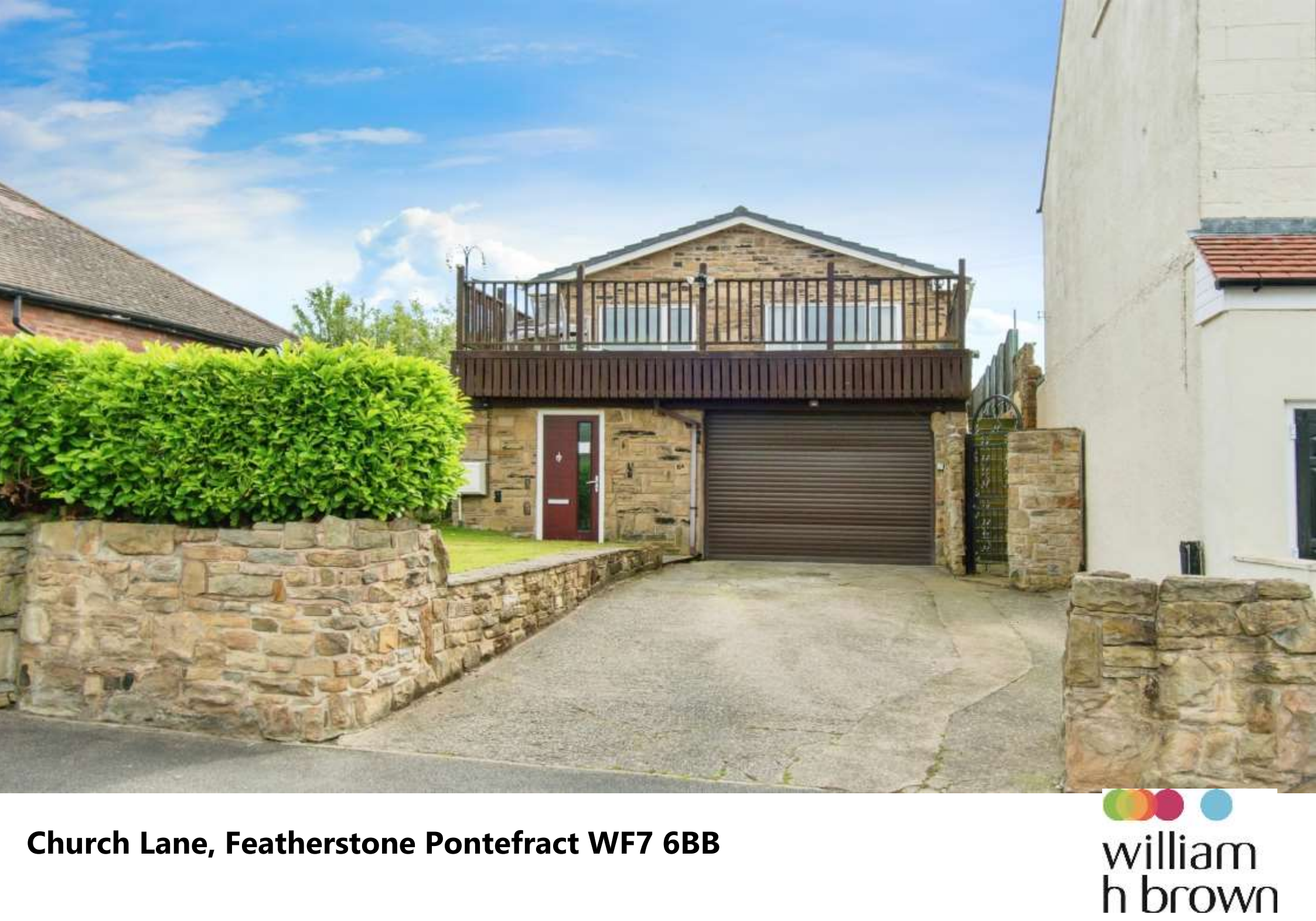
Church Lane, Featherstone Pontefract WF7 6BB