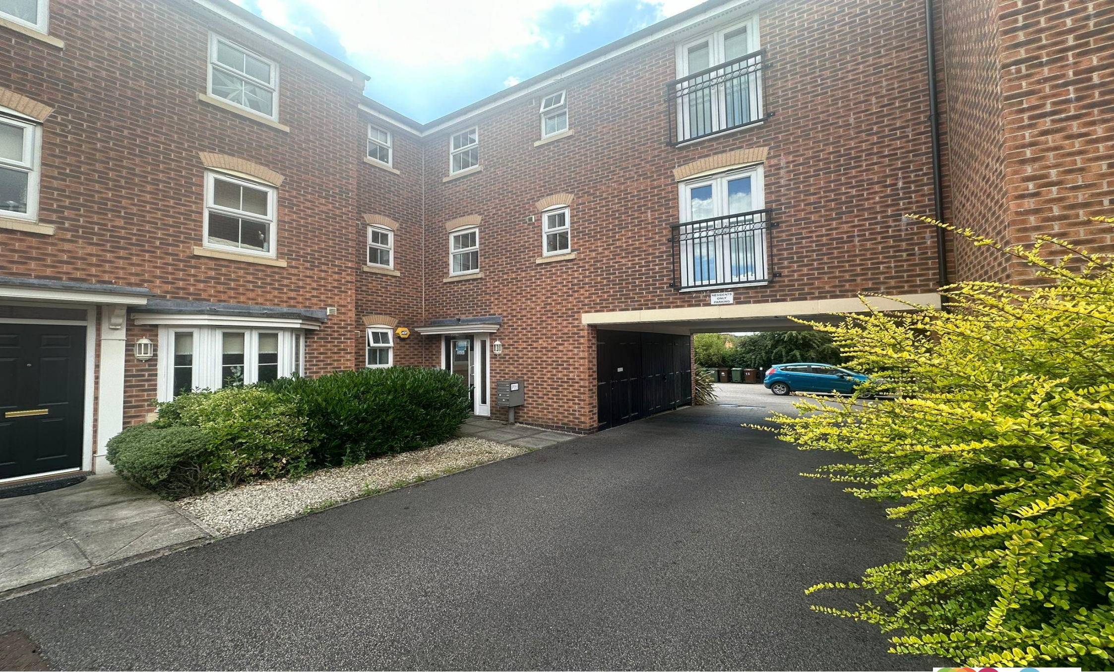
Ebberton Close, Hemsworth Pontefract WF9 4UN