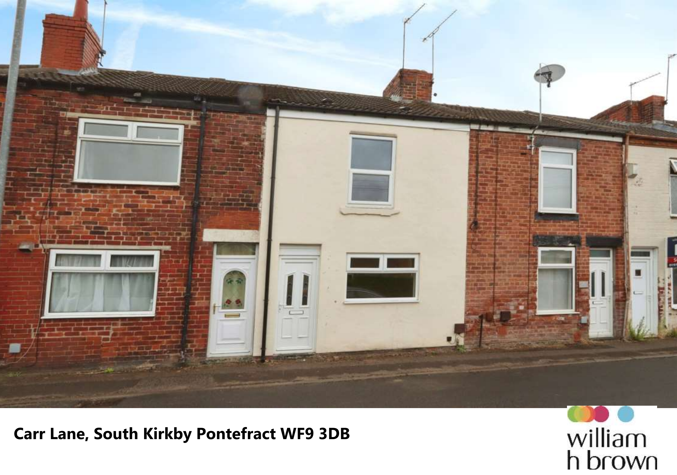
Carr Lane, South Kirkby Pontefract WF9 3DB