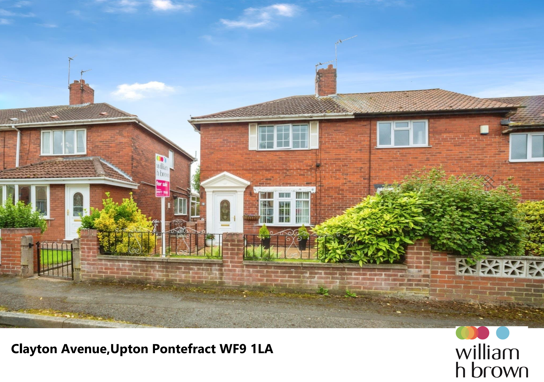
Clayton Avenue, Upton Pontefract WF9 1LA