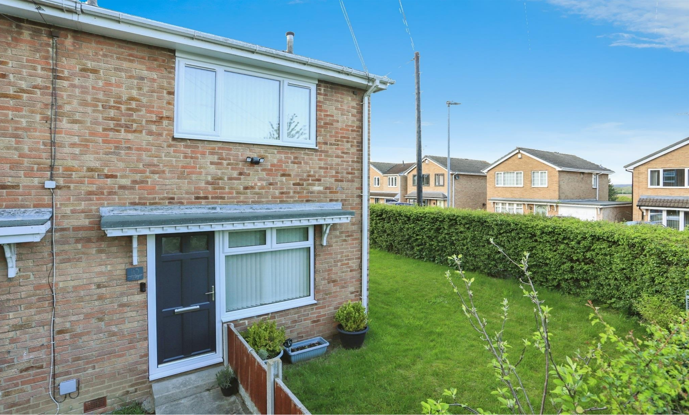
Cricketers Close, Ackworth Pontefract WF7 7PW