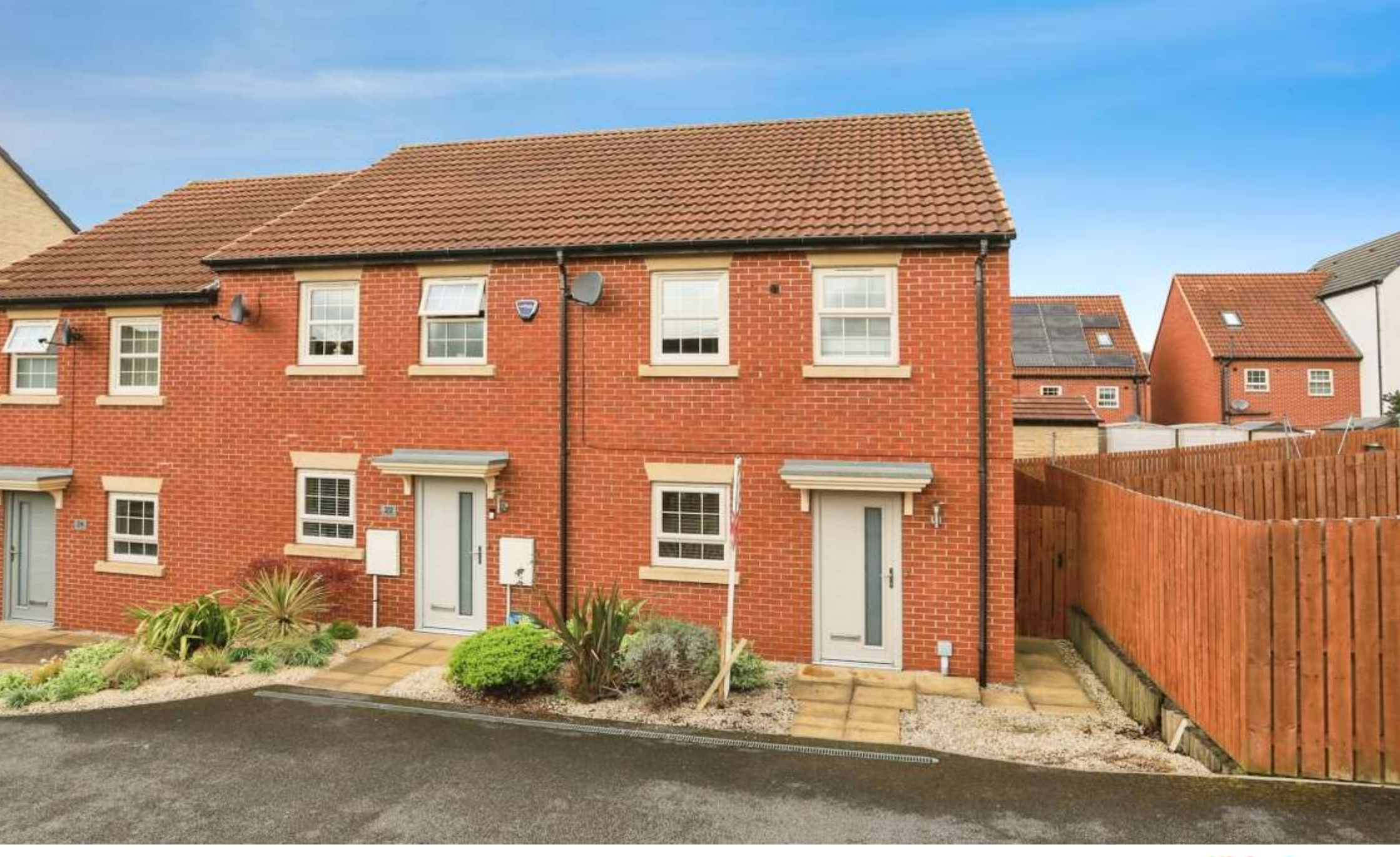
Turnberry Avenue, Ackworth PONTEFRACT WF7 7FB