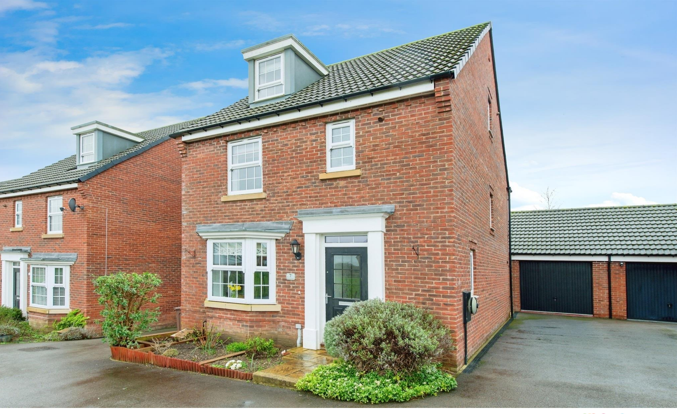
Sorrel Court, Pontefract WF8 4FF