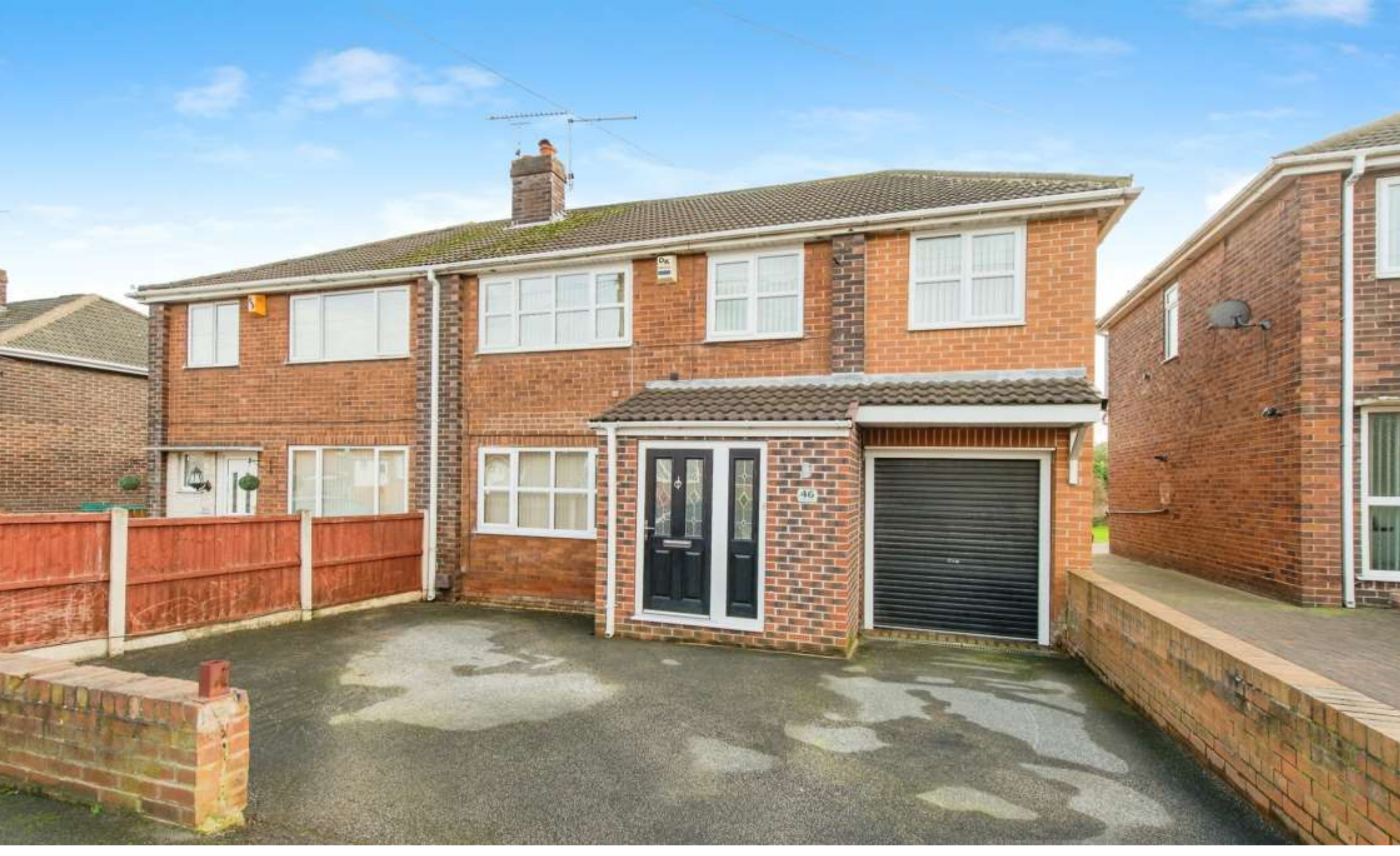
Eastfield Drive, Pontefract WF8 2EZ