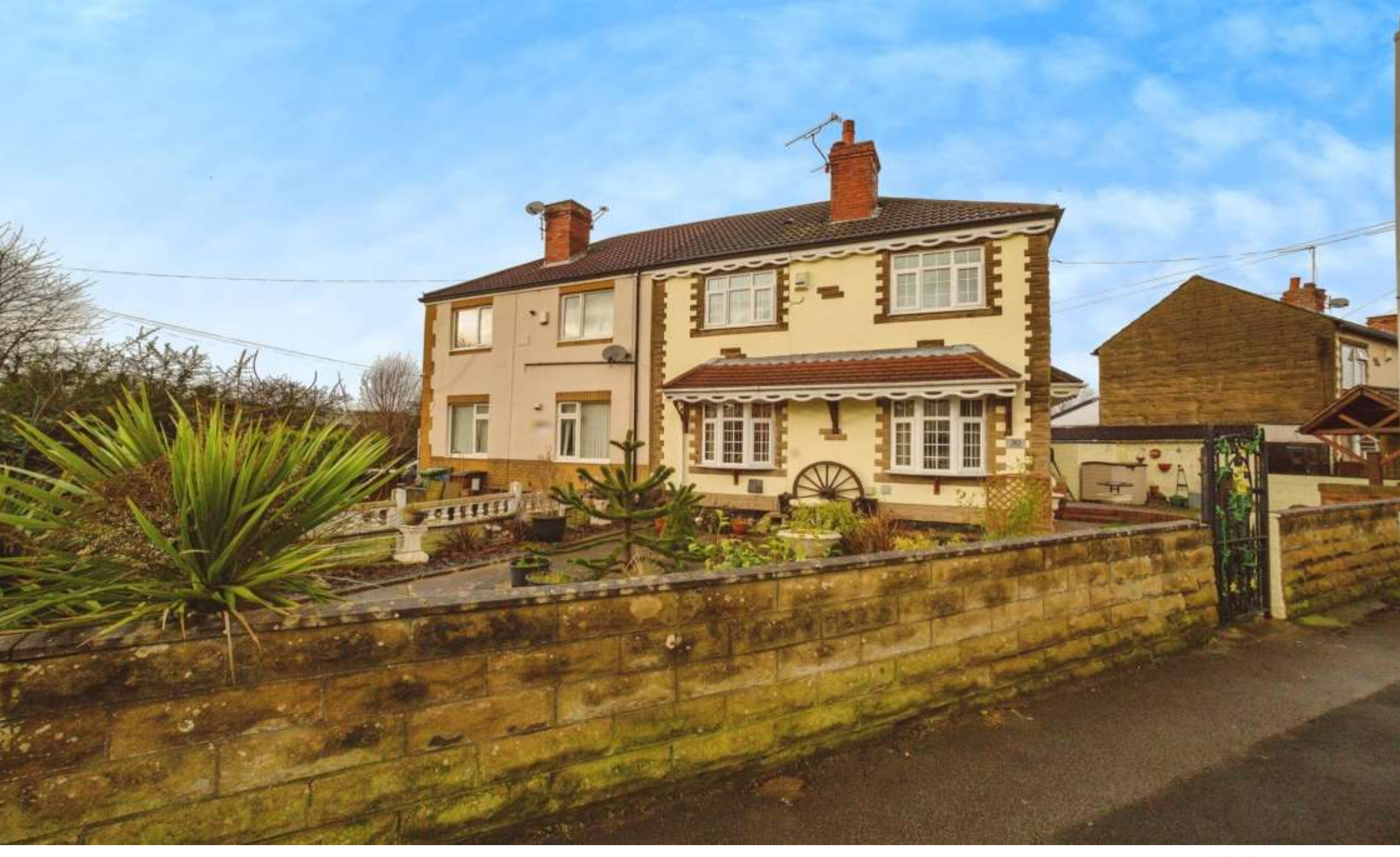
North Avenue, South Elmsall Pontefract WF9 2HF