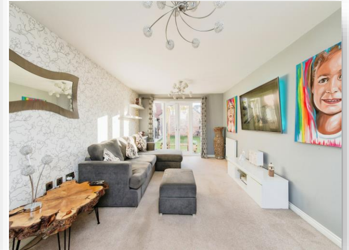
Colliers Road, Featherstone Pontefract WF7 5PG