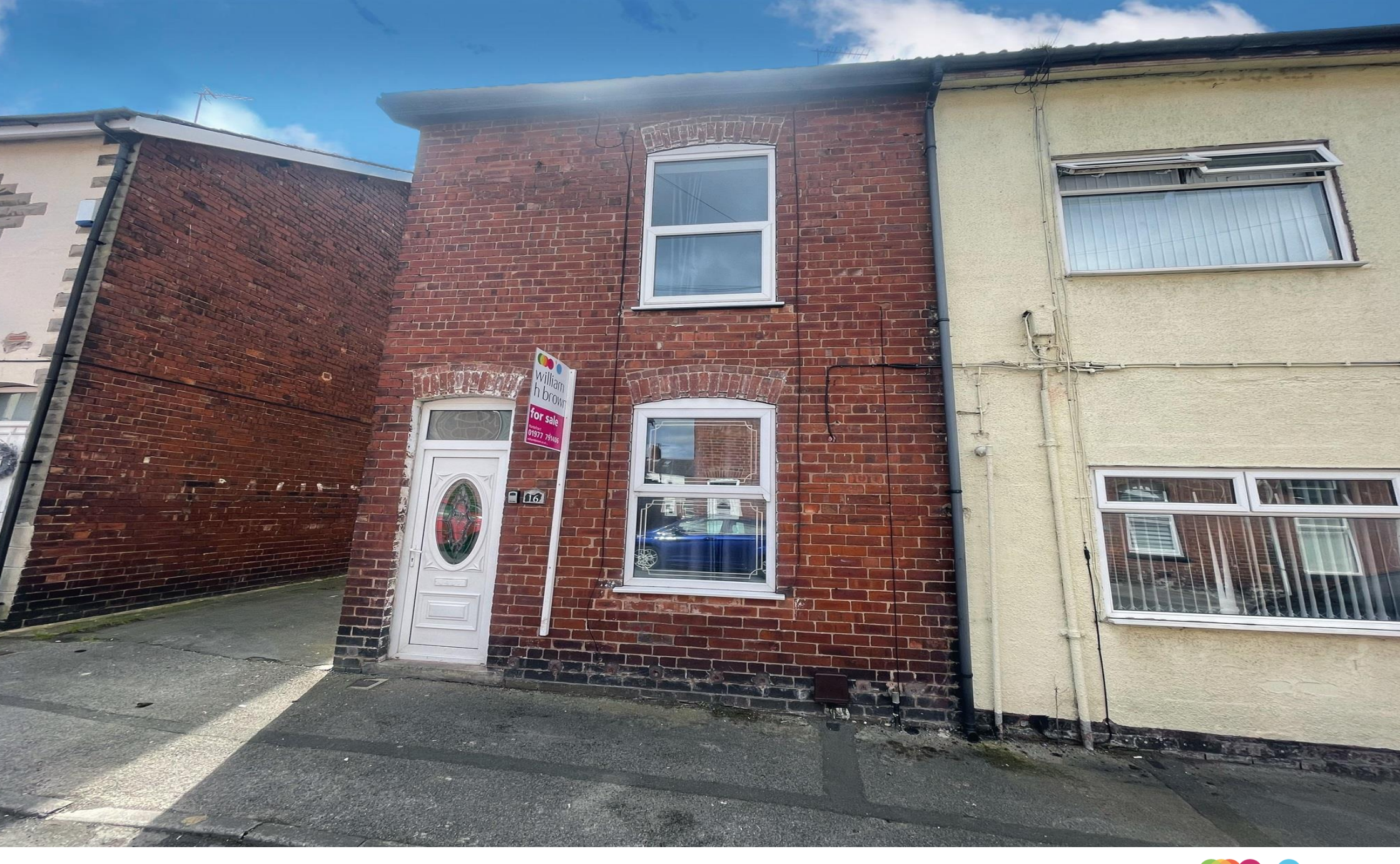
Carlton Street, Featherstone Pontefract WF7 6AA