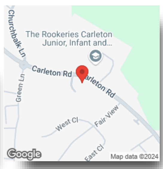
Please note the marker reflects the postcode not the actual property