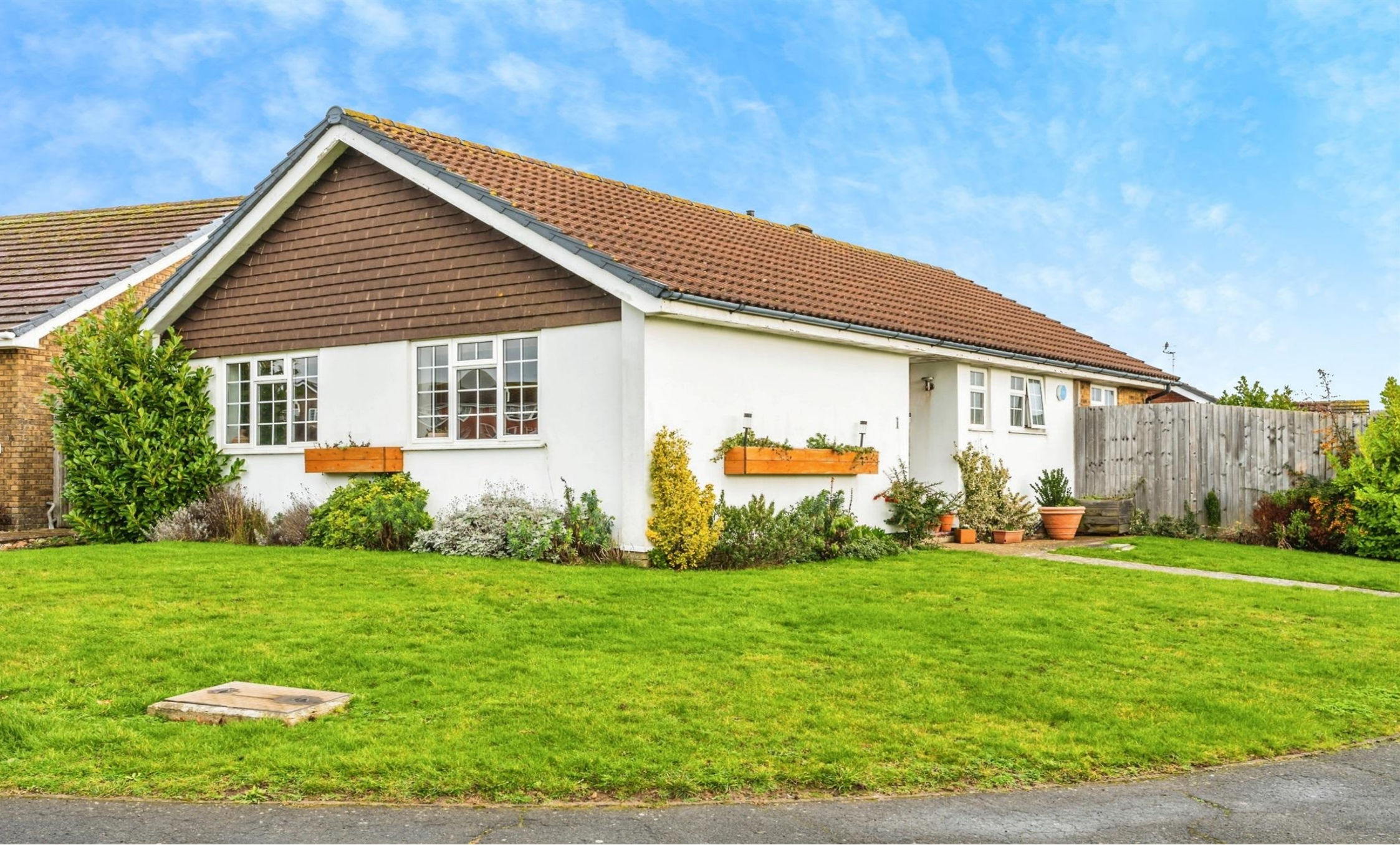
The Ridings, Seaford BN25 3HW