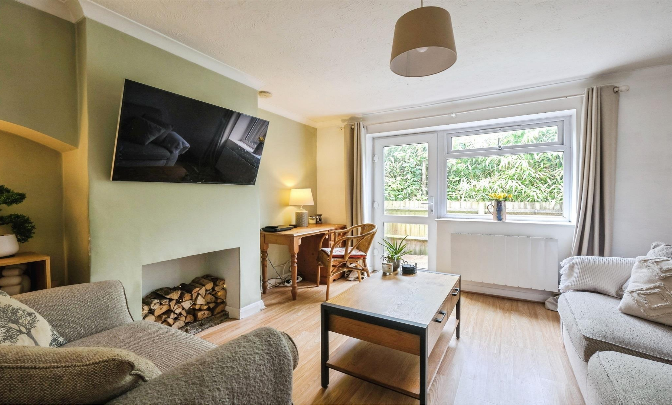
Mill Cottages Sutton Drove, Seaford BN25 3NA