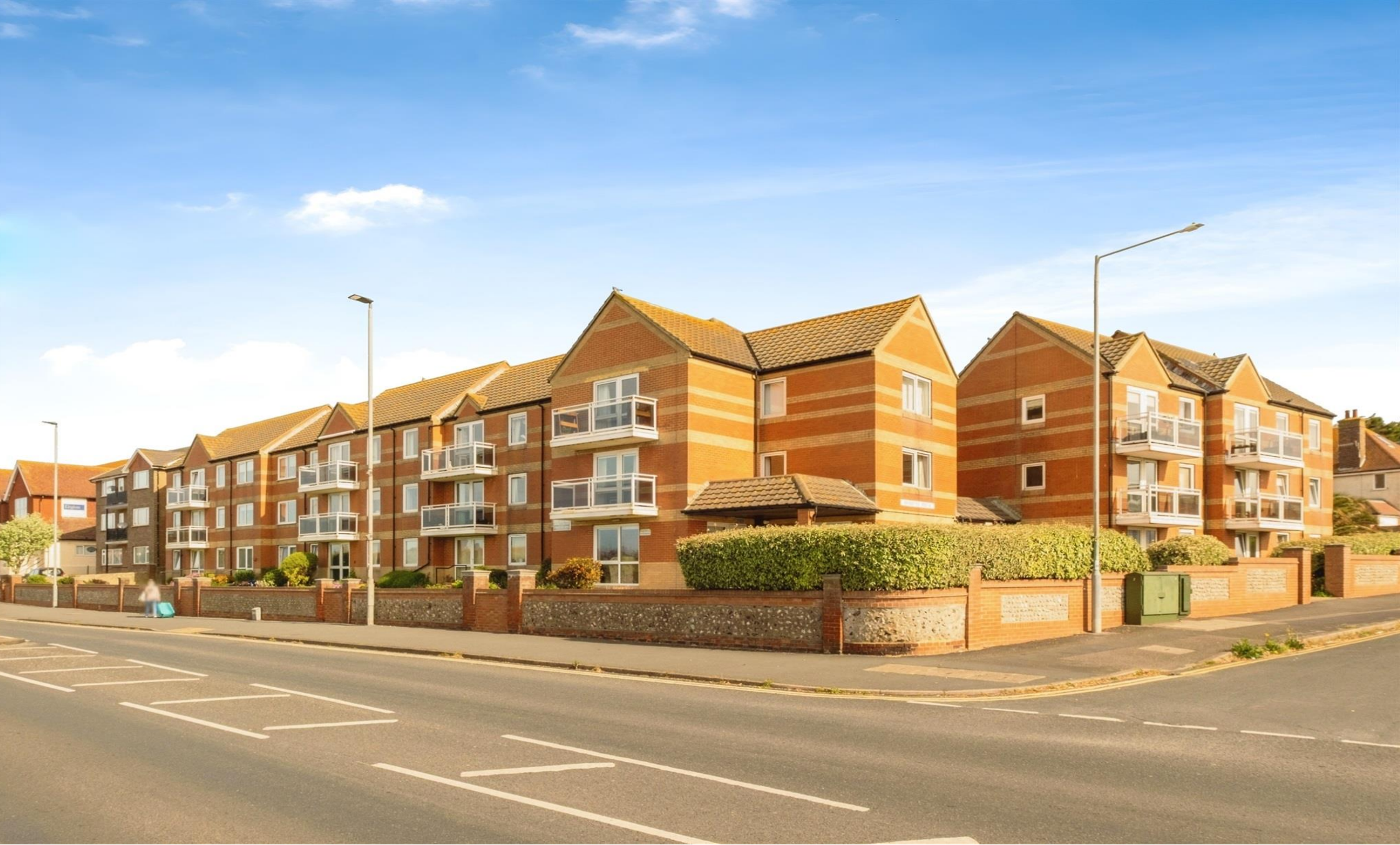
Hometye House Claremont Road, Seaford BN25 2BQ