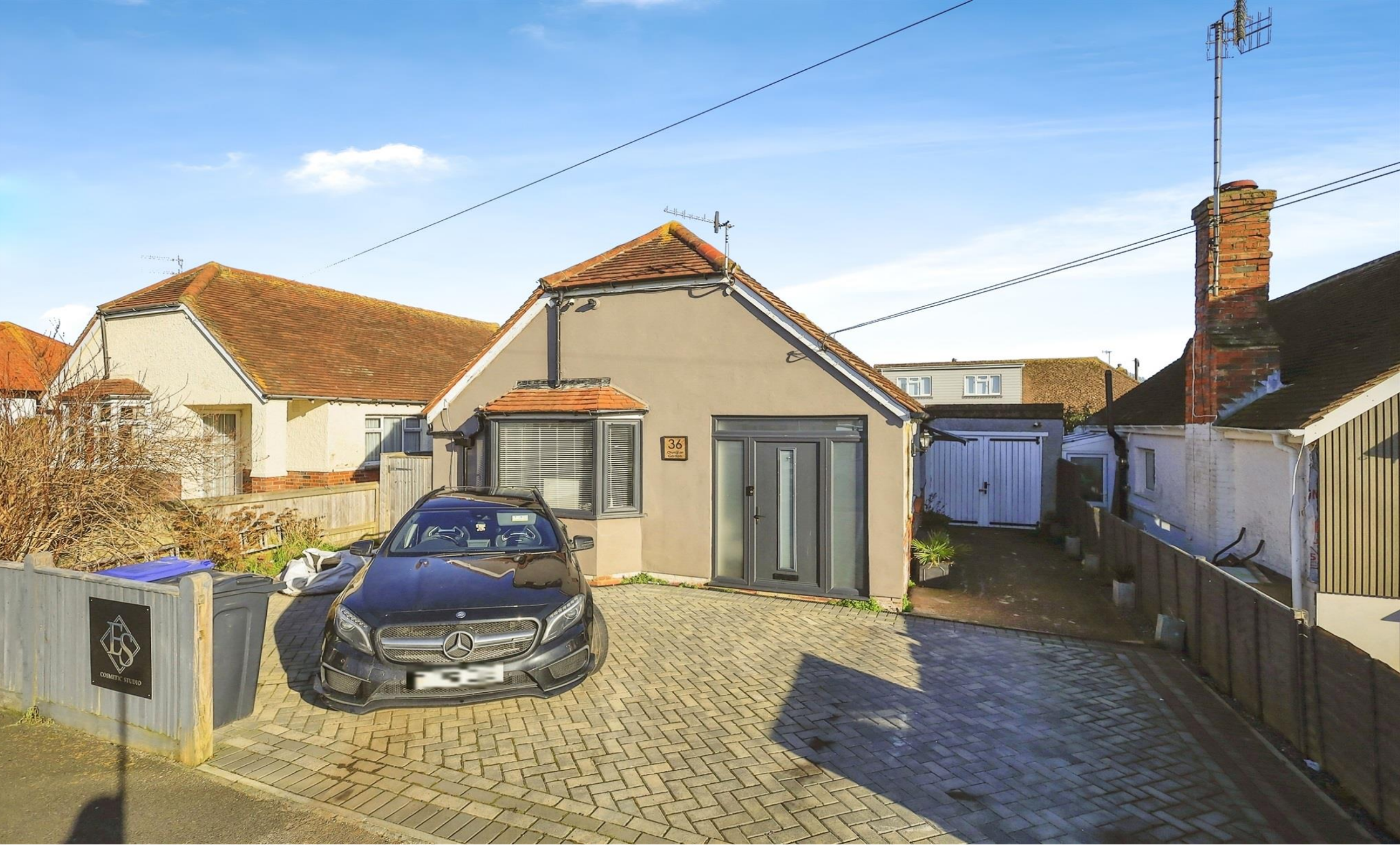
Chyngton Gardens, Seaford BN25 3RS