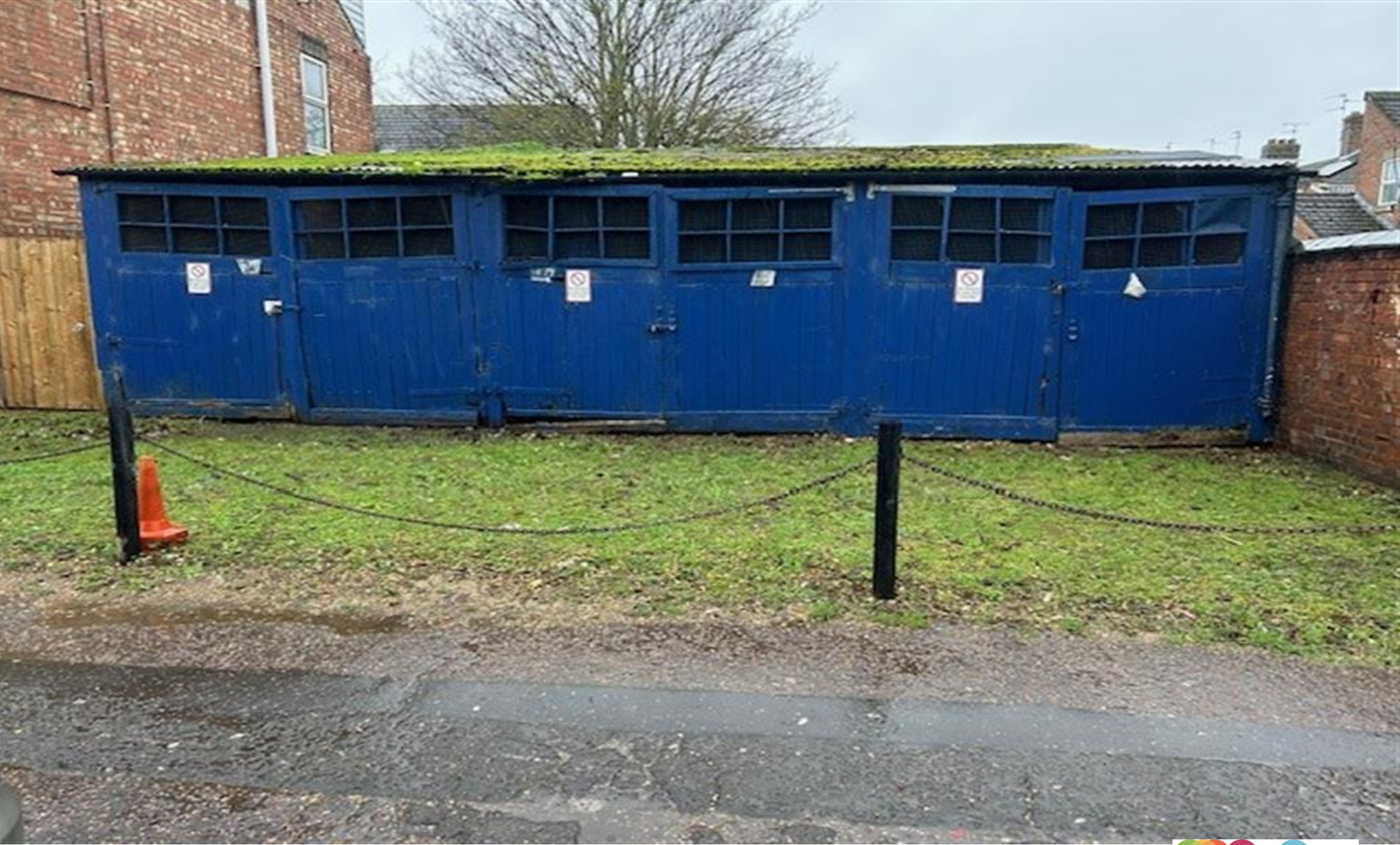
Garages Behind All Saints Road, Peterborough PE1 2QT