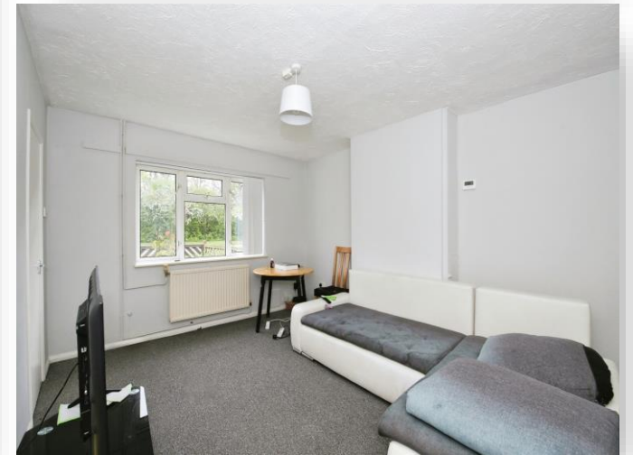
Winwick Place, Peterborough PE3 7HN