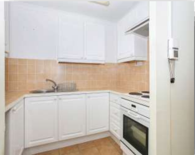
Heritage Court Eastfield Road, Peterborough PE1 4RB