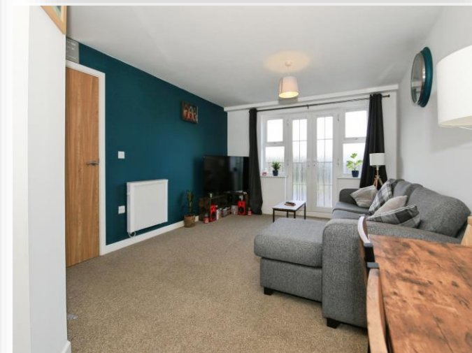
Church Street, Stanground Peterborough PE2 8GH