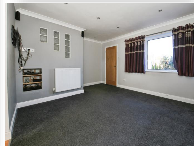
Grounds Way, Whittlesey Peterborough PE7 2BU