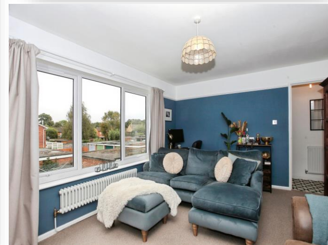
Stoneleigh Court, Peterborough PE3 9QP